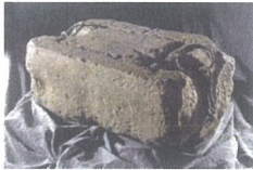
Fake-stone Now in Edinburgh Castle