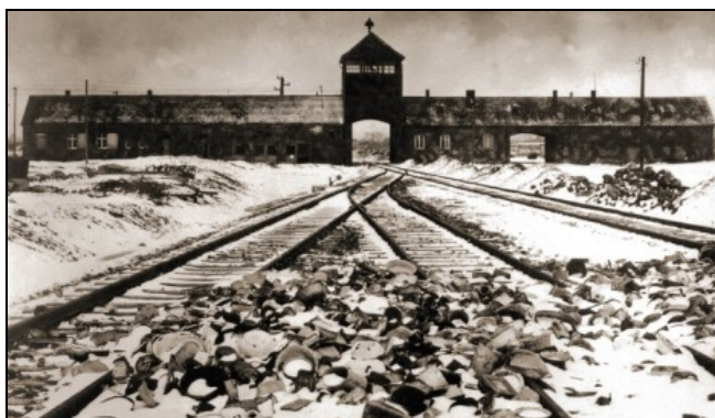
Death camp: Auschwitz, where tens of thousands of slave labourers died working in a factory run by German firm I. G. Farben